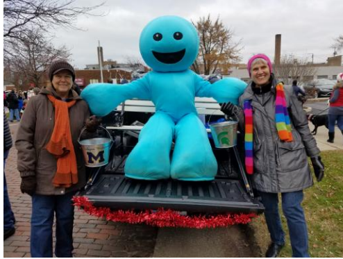
Splash at the Reindog Parade

Take a look at what some of the volunteers have been up to lately!!!